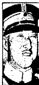
Japan's new minister of war in the recently formed cabinet of Premier Koki Hirota is Gen. Toshihazu Terauchi. The war chief was one of the seven army leaders who formerly composed the Nipponese supreme war council.