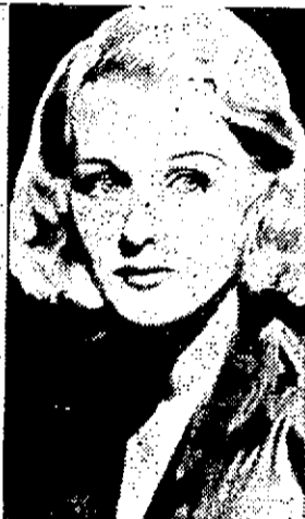
Of course, all you film fans know Joan Bennett, shown at left. But if you just can't recall the name of that charming actress at right, she's Joan Bennett! A Hollywood makeup man got busy when studio officials wanted Joan transformed from a demure ingenue to a "sophisticated lady," and put a different face on matters, and Joan, with the magical result shown above. In the process, Miss Bennett's hair-line was raised by means of an electric needle, to give her a "widow's peak"; her eyebrows were arched higher; her lips were touched up a bit; some makeup was added and—my dear, you'd hardly know her!