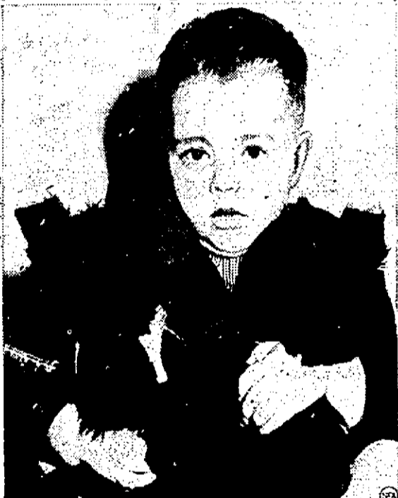
Fight between these two stony Scottie pups you'll find a face for which a Hollywood movie studio has contracted to pay from $400 to $1000 a week for the next six years. Of course, you recognize it! It belongs to mischievous, 7-year-old Spanky McFarland of Our Gang comedies, hair combed and suit pressed—at least while a Los Angeles judge approved the new contract, recently.